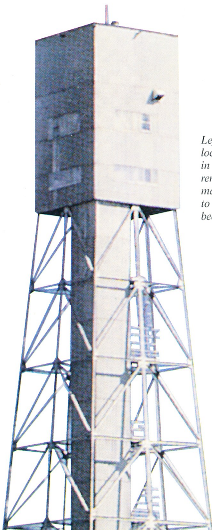
Left: The shot tower, a local landmark, was built in 1960. It is a valued reminder of one of the many business enterprises to which Deer Park has been home.