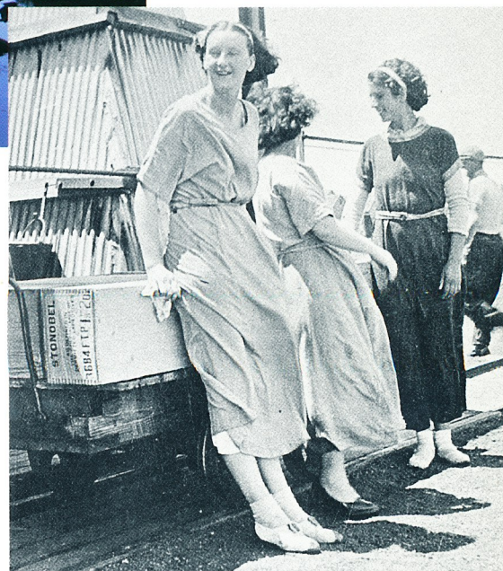
Above: Young working ladies of the Nineteen Thirties made their cheerful contribution to the history of ICI at Deer Park.

More offices and manufacturing facilities followed, to facilitate a growing range of products such as sporting ammunition, slide fasteners (zippers), detonators, fuses and nitrocellulose. Australia's first synthetic ammonia plant commenced production in 1940.