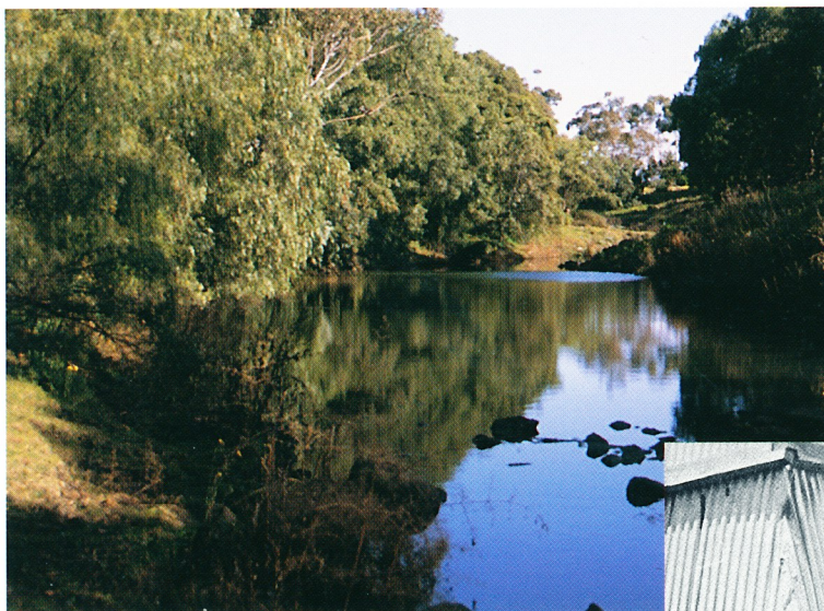
Right: The Kororoit Creek as it looks today. A haven for all kinds of plant and animal life.