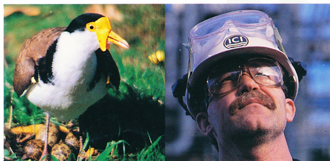
Above: The Masked Plover is but one of many bird species which, nurtured by employees, breed happily on the site.