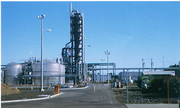
Above: Modern plant has replaced many of the original buildings at Deer Park, ensuring the highest levels of safety, efficiency and environmental performance.

This unique site which has been the backdrop for a host of business and human activities will continue to be cherished, protected and sensitively utilised for the benefit of all.