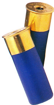
Above left: Cartridges for sporting shooters were produced by ICI at Deer Park until 1979.

A new 'Leathercloth' factory in Deer Park opened in 1929 under the cloud of the Wall Street crash. Although the Depression years brought mixed fortunes, record-breaking sales of explosives were achieved.