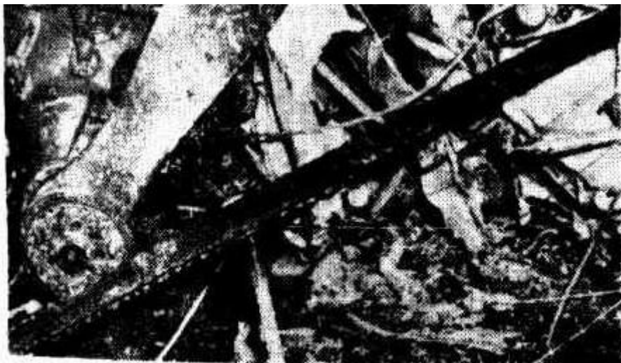
BURNT-OUT WRECKAGE of the Avro training plane which crashed last night at Melton, killing two Melbourne taxi-drivers.